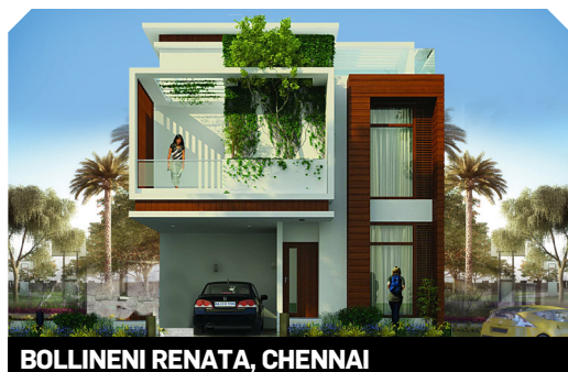
BOLLINENI RENATA, CHENNAI