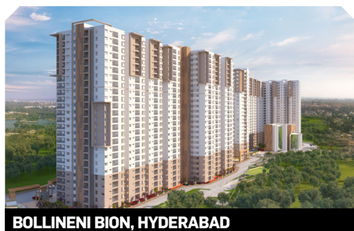
BOLLINENI BION, HYDERABAD